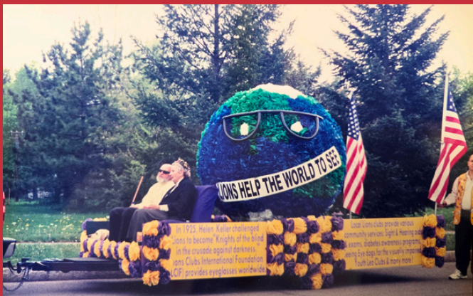
GATES GREECE LIONS CLUB