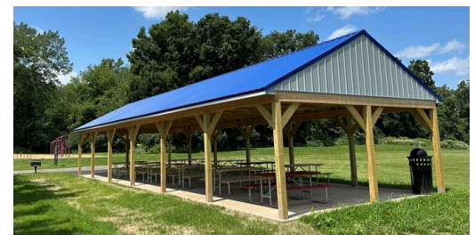
FIRST RESPONDERS PARK 4310 LYELL ROAD

REFUND/CHANGE OF DATE FEE POLICY: NO REFUNDS WILL BE MADE UNLESS NOTIFICATION OF CANCELLATION IS GIVEN 14 CALENDAR DAYS IN ADVANCE. THE PROCESSING FEE FOR ALL RESERVATION REFUNDS IS $25. THERE IS A $20 CHARGE FOR CHANGES OF DATE OR LOCATION. ANY DATE CHANGE MUST ALSO BE RECEIVED 14 CALENDAR DAYS IN ADVANCE.