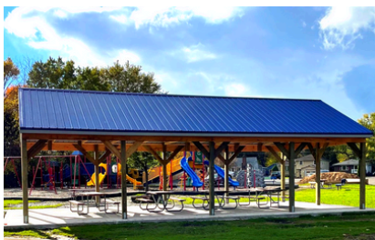
WEGMAN RD PARK 510 WEGMAN RD

FRIDAY - SUNDAY RESIDENTS - $75 NON-RESIDENTS - $150