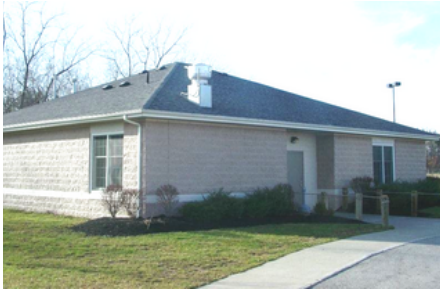
WESTGATE PARK 1489 HOWARD RD

FRIDAY - SUNDAY RESIDENTS - $150 NON-RESIDENTS - $300