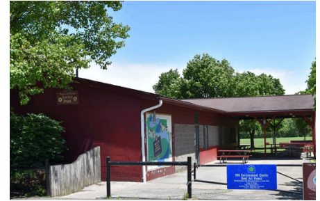
LIONS PARK 100 KENTUCKY AVE