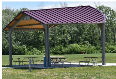
MEMORIAL PARK 160 SPENCERPORT RD