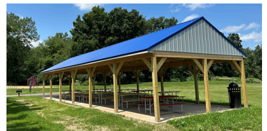
FIRST RESPONDERS PARK 4310 LYELL ROAD

REFUND/CHANGE OF DATE FEE POLICY: NO REFUNDS WILL BE MADE UNLESS NOTIFICATION OF CANCELLATION IS GIVEN 14 CALENDAR DAYS IN ADVANCE. THE PROCESSING FEE FOR ALL RESERVATION REFUNDS IS $25. THERE IS A $20 CHARGE FOR CHANGES OF DATE OR LOCATION. ANY DATE CHANGE MUST ALSO BE RECEIVED 14 CALENDAR DAYS IN ADVANCE.