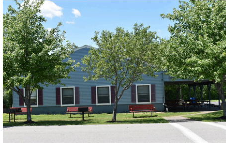
MEMORIAL PARK 160 SPENCERPORT RD